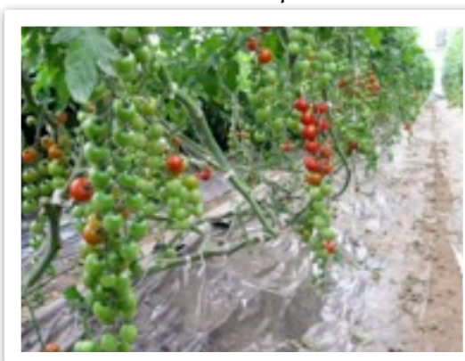
Cherry tomatoes in the high tunnel