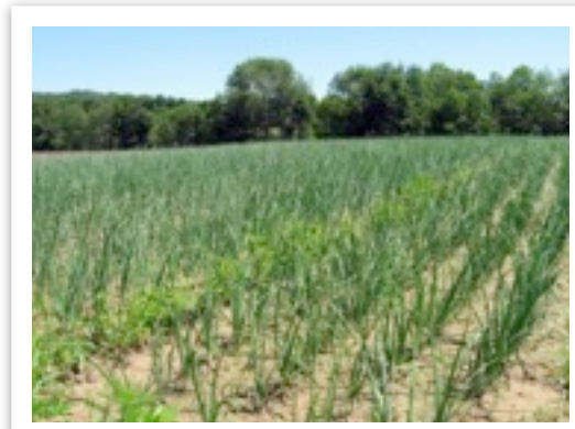
25,000 plus onions in the field

NEW TO THE SHARE THIS FALL Made by bees foraging our own vegetables, hay fields and cover crops, we're doing our own HONEY this year on a scale large enough to provide it in the shares- look for it soon.